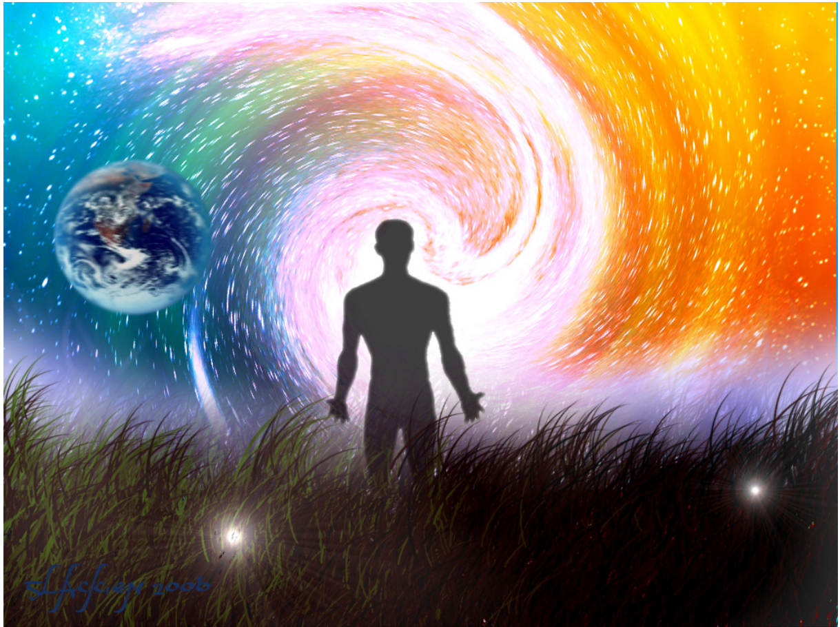
"Life" created by Revenant aka Slaygen